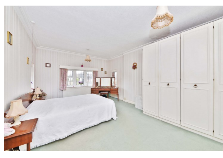
To view this property call Robert Powell on 0121\ 454\ 6930